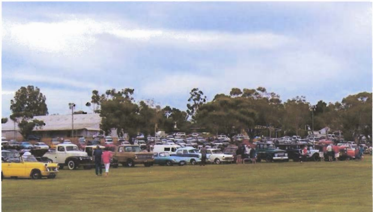
Northam Vintage Swap Meet 2011

E-mail address: fsi93402@bigpond.net.au ABN 33 053 396 253