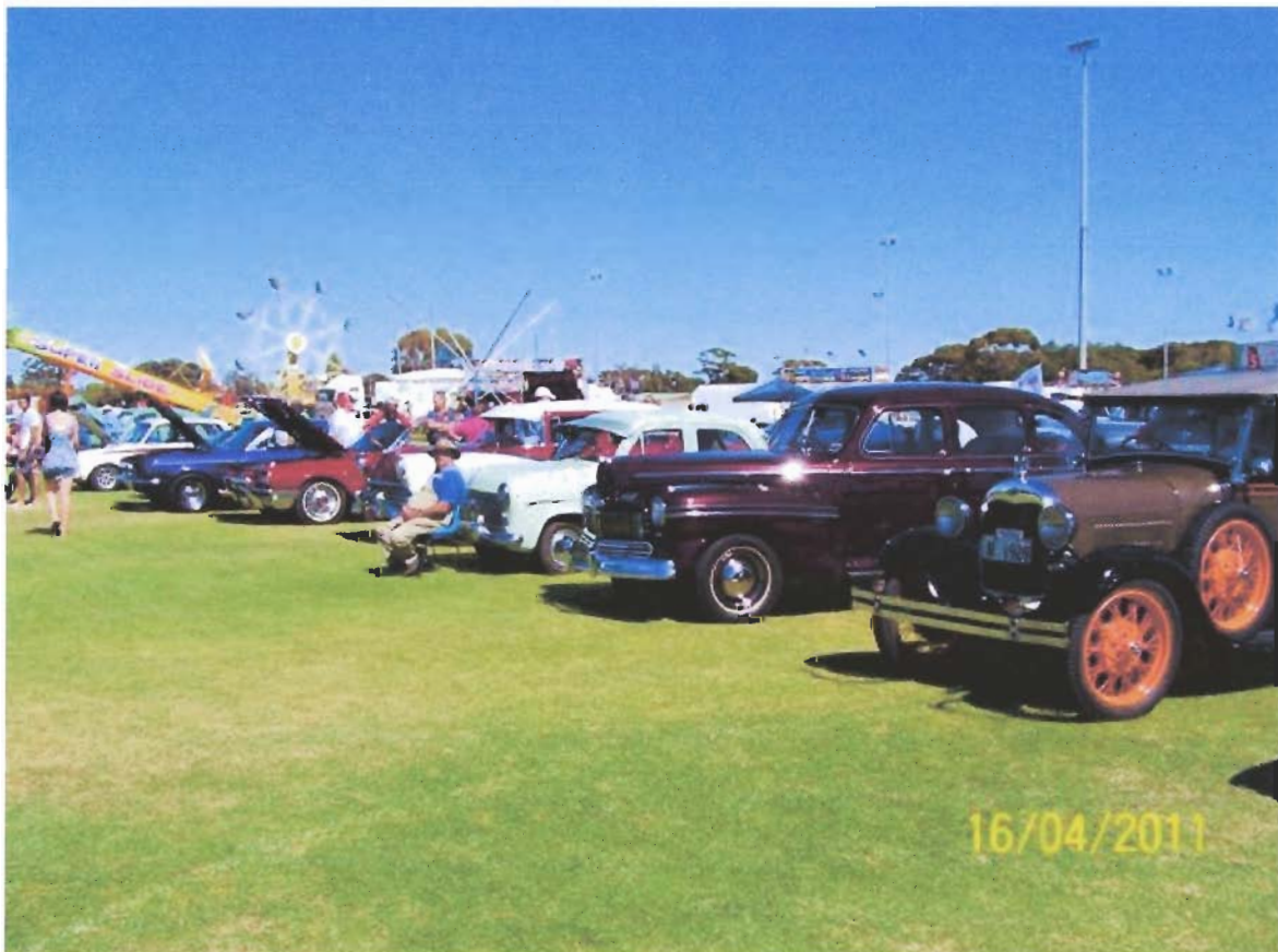
Merredin Show Saturday 16 th April

E-mail address: fsi93402@bigpond.net.au ABN 33 053 396 253