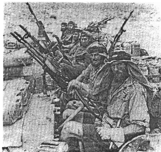
The Long Range Desert Group

They called themselves Herrenvolk, so they could enslave other countries and in the end the Allies won so that we, and our children, could live in a democratic and free country of our choice.