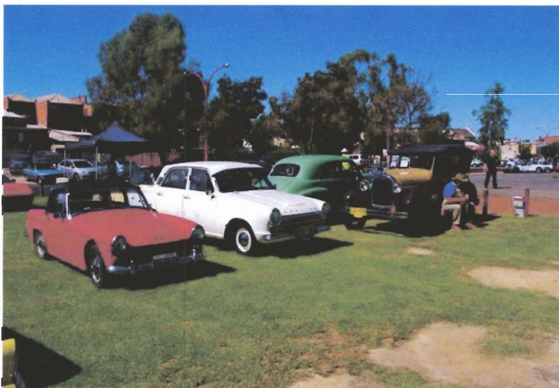
Northam Flying 50 Display .

E-mail address: fsi93402@bigpond.net.au ABN 33 053 396 253