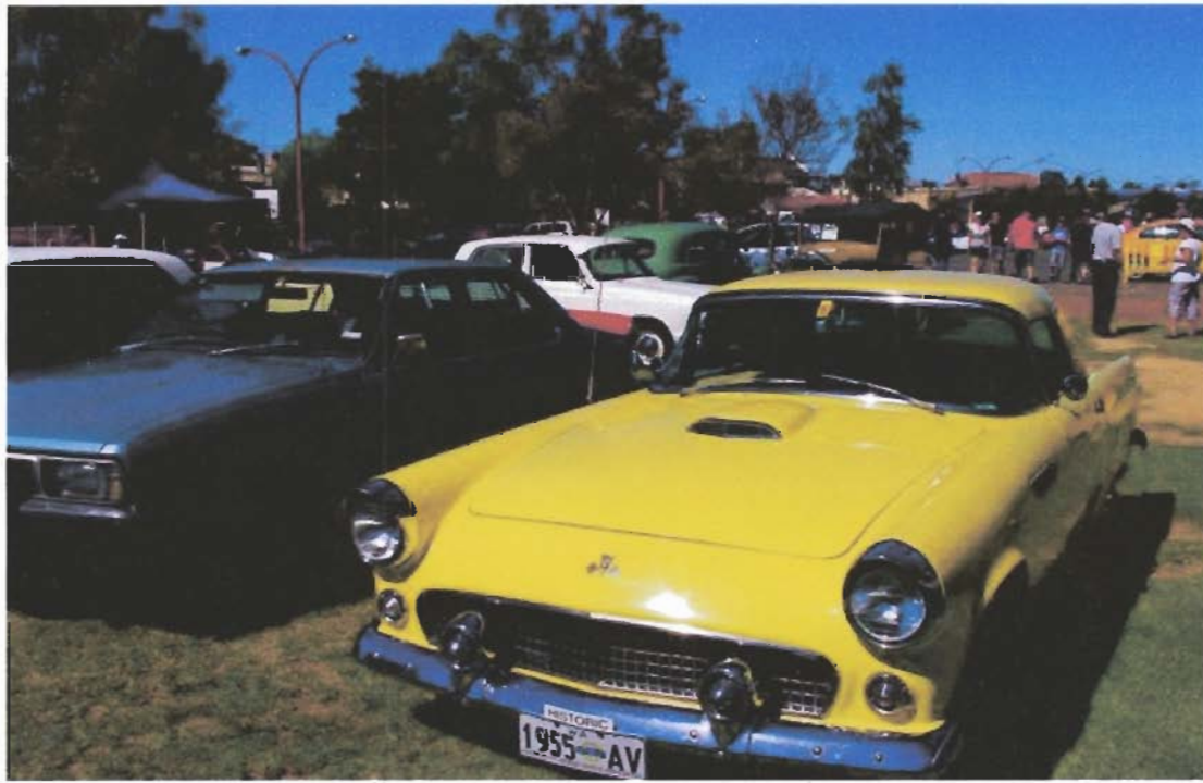
Northam Flying 50 Display.